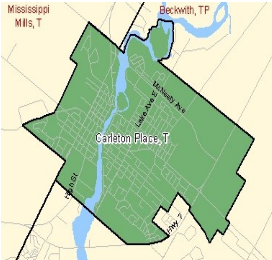
Population, 2011 and 2006 Censuses

In 2011, Carleton Place (Town) had 3,973 private dwellings occupied by usual residents. The change in private dwellings occupied by usual residents from 2006 was 7.3%. For Canada as a whole, the number of private dwellings occupied by usual residents increased 7.1%.